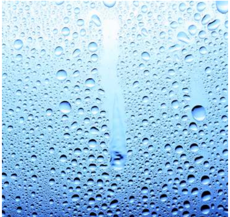
Indoor-generated moisture and moisture-related indoor air quality problems in houses and units in multi-unit residences will be discussed in this helpful guide.

For renters, report all plumbing leaks and moisture problems immediately to your building owner, manager or superintendent. For the owners of condominiums, if the moisture problem is coming from inside your unit, it is likely something you will have to deal with. If the moisture is coming from outside the unit (leaks through walls, windows, doors, ceilings or plumbing), contact your condominium manager.